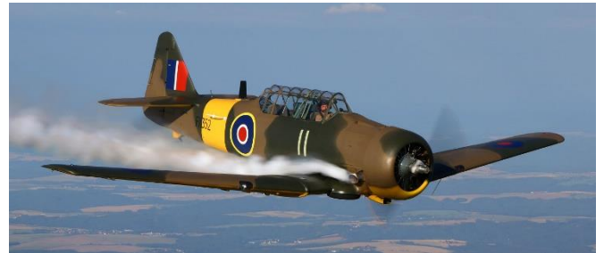
Harvard MK II

On the 18 th December 1939, he was posted to No.7 Elementary Flying Training School at Desford. By May 1940, he was training to fly Harvard's.