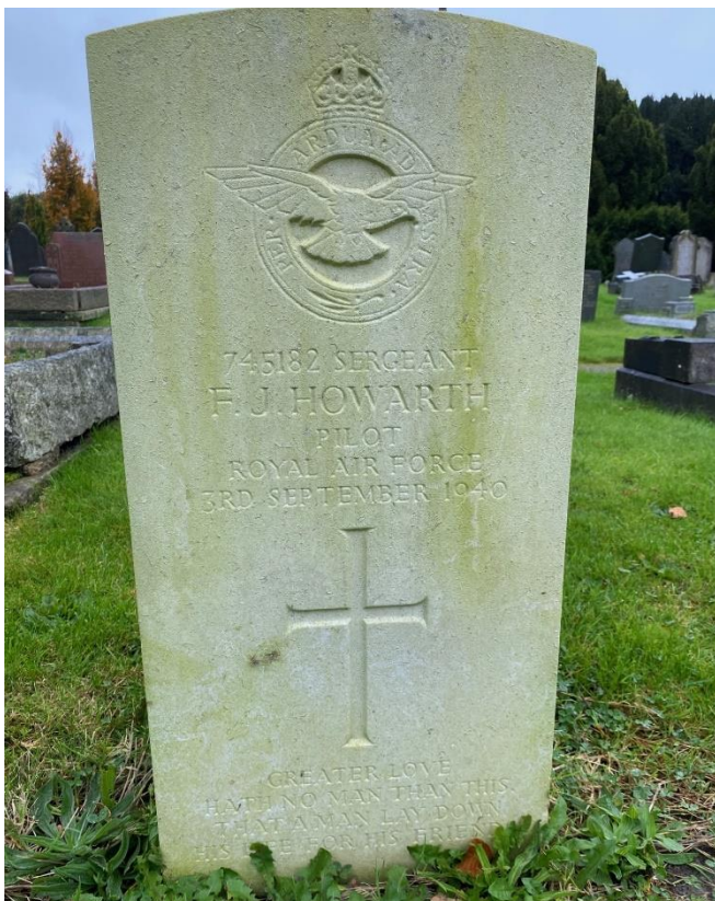
St Catherine's Churchyard