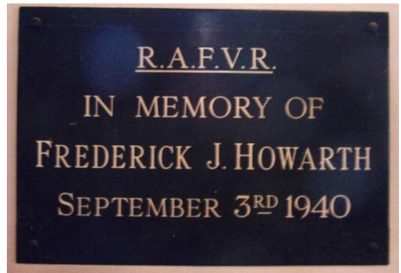
Plaque St Catherine's Church